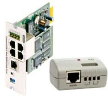
Figure 3. Optional Web/SNMP card with EMP probe for temperature measurement of an external battery cabinet or rack.

In the interests of continual product improvement all specifications are subject to change without notice.