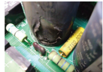
Photo 2. Random component failure.