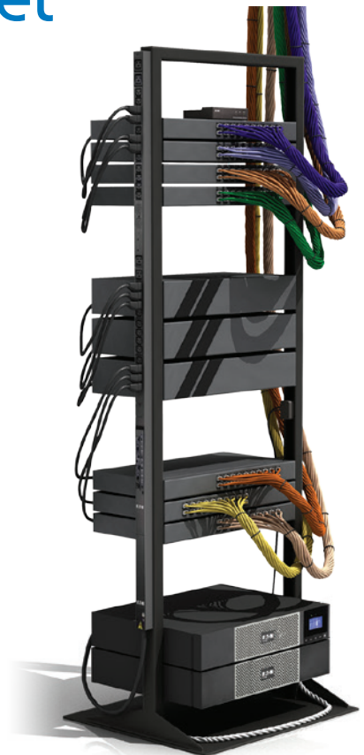
Network Closet Rack

While network closets take on all shapes and sizes, they are essentially an arm of the data center and as an important component of all mission-critical environments, must be organized, protected, and managed efficiently and effectively. IT professionals are charged with keeping the technology infrastructure functioning, even in the face of constrained resources and increasing complexity. By selecting the correct rack and power infrastructure, paired with management hardware and software, organizations can keep their businesses up and running. In this white paper, we go beyond simple how-to advice for keeping IT equipment operational, and discuss how efficiently managing, organizing, and operating network closets saves time, saves money, and avoids risk utilizing the existing space and equipment.