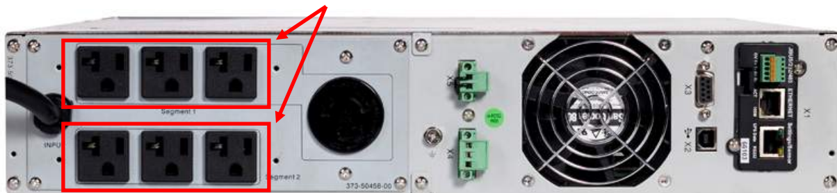
Figure 1. Eaton 9130 UPS with two load segments

For optimal performance in the event of a power outage, non-essential loads are plugged into different load segments than those that are essential. Shortly after the UPS goes to battery, peripherals are shed by their load segment turning off, while both critical and non-critical servers continue to operate. Then after a user-defined time, UPS protection software begins to gracefully shutdown non-critical servers, further extending runtime to critical devices. Finally, as the UPS nears the end of its available battery backup time, critical servers are safely shutdown.