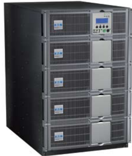
Eaton MX Frame