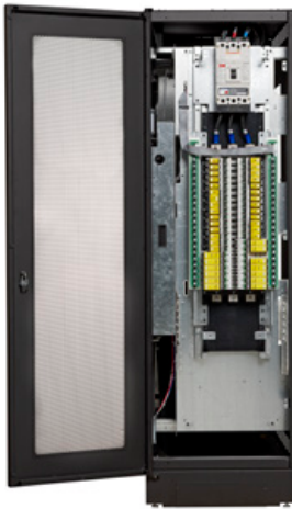
RPP with Bussmann panelboards