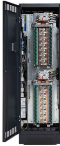
RPP with Eaton PRL2 panelboards